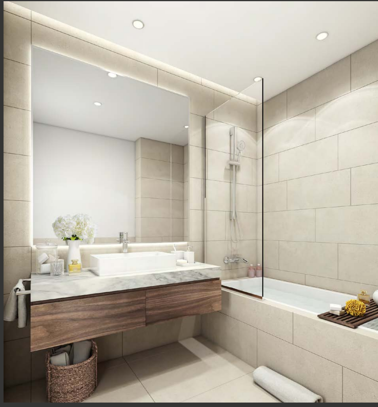
HIGH-END FINISHING FOR ULTIMATE COMFORT.